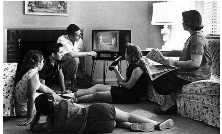
A family watches the moon landing on TV on July 20, 1969

Of the roughly 8-day mission, however, only the moon landing and the subsequent "splashdown" into the Pacific Ocean