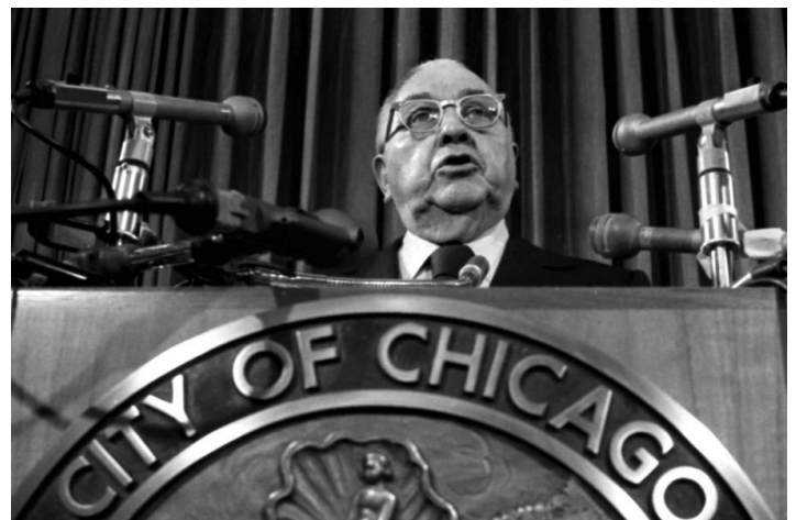
Chicago Mayor Richard J. Daley speaks during a news conference