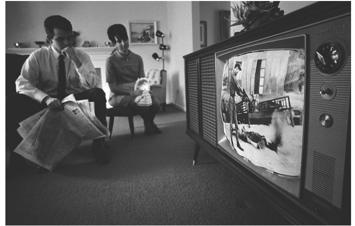
A couple watching footage of the Vietnam War on their television, February, 1968.

The relationship of the free press to the military operations and government agencies that oversaw them throughout the Vietnam War was a dynamic one that ebbed and flowed throughout the conflict. Due to concerns about national security, President Eisenhower attempted to control the flow of information by establishing thirty additional levels of information classification in 1953, effectively restricting public access to a great deal more information than had previous administrations and laying the groundwork for how the news media would interact with government officials throughout the Vietnam War that would begin two years later. While there were of course legitimate security reasons for this action, new restrictions also served to help the administration cover up information it did not want in the hands of the press media or public. When President Kennedy—himself a former journalist—took office, he had a much greater command over the state of journalism and television in the United States, and he