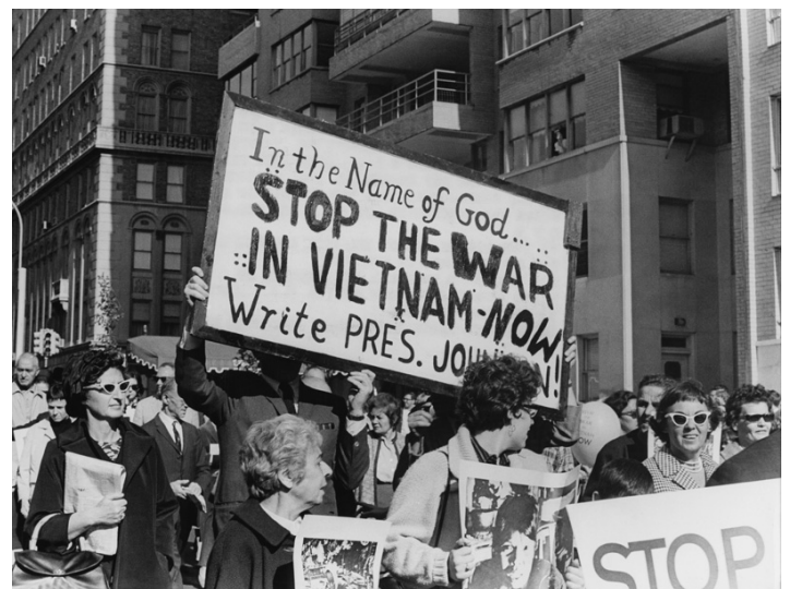
Vietnam War protests