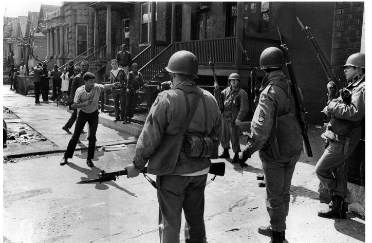
Chicago Riots of 1968.