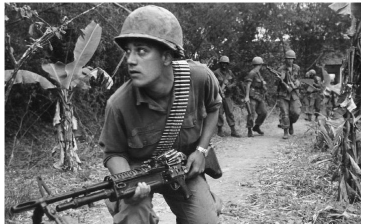
The Vietnam War