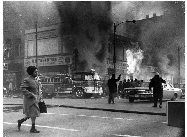
Chicago Riots of 1968.

When Dr. Martin Luther King, Jr. was assassinated on April 4, 1968, communities across the country grieved and were thrown into crisis by the news. Riots erupted in many cities, but no other city in the country was helmed by Chicago's Mayor Daley and his political machine. Richard J. Daley was elected in 1955 and lorded unyielding power over the city of Chicago until his death in December of 1976. Daley was—and still to this day is—infamous for his extreme tactics of voter influence and coercion, particularly in the severely segregated city's black neighborhoods, to maintain his position, and he was known to appoint loyalists to his administration and ensure their longevity through corruption, public manipulation, and careful gerrymandering of voting districts. He was a staunch segregationist and did everything he could to maintain the established racial barriers between neighborhoods; he knew that if the black population were to disperse and be represented in voting blocs throughout the city (as would happen under a city-wide policy of integration), he would be ousted at the next election. Throughout the mid- and late-60s, Chicago's civil rights activists had utilized tactics both of nonviolence and of armed resistance in their fight to integrate the city under Daley, but he had corrupted the city's political leadership so thoroughly that they had little success in effecting lasting change and, in fact, were overwhelmingly met with police violence and brutality